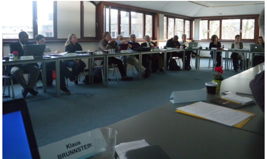
Attendees at IFIP WG9.2's working group held in Namur, Belgium in January 2011