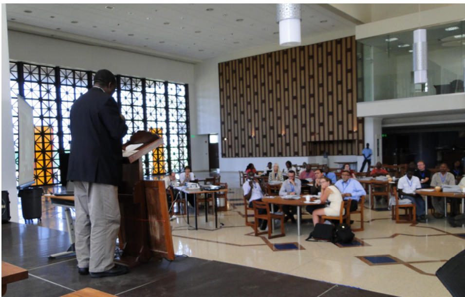
Assistant Minister of Education of Kenya addresses the IIGWE2011

Because of the special venue in Mombasa this conference was not only about ICT and Informatics in education. It was also about co-operation between south and north, east and west. It was about sharing experiences and knowledge, to learn from the past and to face a common future. Practitioners and researchers were gathered to exchange their views and practices. Just to give some impression of this collaborative approach: during the opening session the Assistant Minister of Education of Kenya spoke about the importance of ICT in Education in his country. He addressed an audience not sitting in rows, but at round tables. Perhaps this could be the new standard for IFIP conferences!