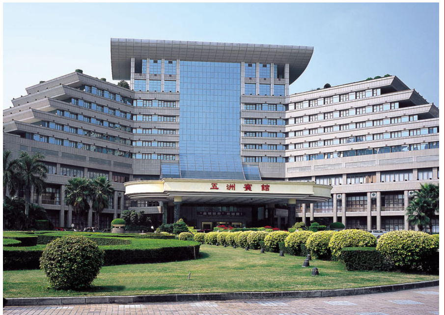
Shenzhen Wuzhou Guest House

As the initiator of the proposal, the first World CIO Forum will be held in China. Authorized by IFIP executive committee, the Chinese Institute of Electronics will organize this forum. The proposal of World CIO Forum is also approved by IFIP members, the Ministry of Industry and Information Technology of People's Republic of China, State-owned Assets Supervision and Administration Commission of the State Council of the People's Republic of China, Ministry of Commerce of the People's Republic of China, Ministry of Science and Technology of the People's Republic of China, China Science and Technology Association and People's government of Shenzhen.