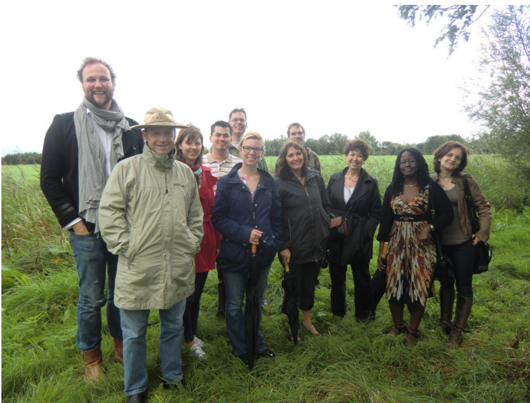
The Ph D colloquium participants after a walk in the swampy field of the Art Centre

The students were encouraged to engage in peer review processes as a way to develop and to promote academic confidence. Another important aspect of the Ph D process that was emphasized was the necessity to manage our family lives in a manner that does not lead to complications. All in all the colloquium was a great opportunity for the participating students to network and to engage with senior researchers in a very relaxed environment.